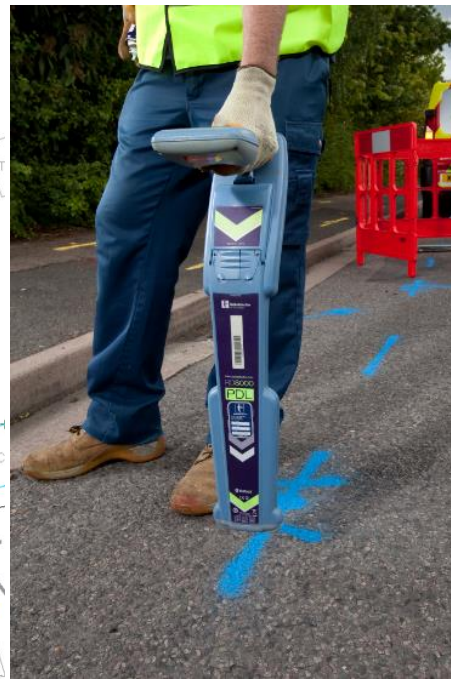
PAS 128:2014 Specification for underground utility detection, verification and location